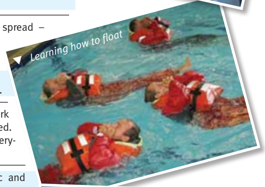
Learning how to float