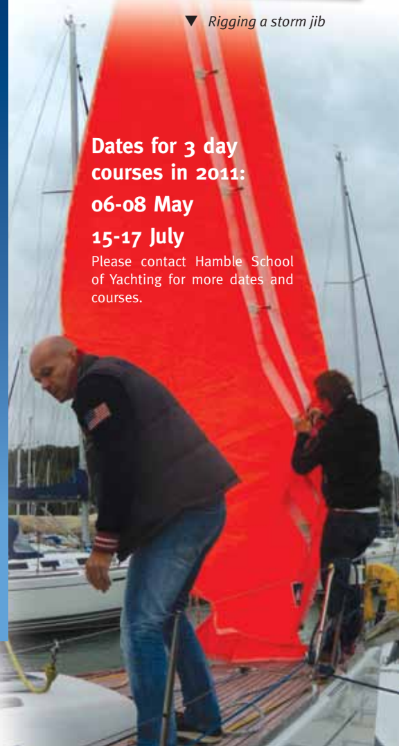
Rigging a storm jib