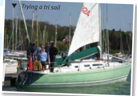
Trying a tri sail